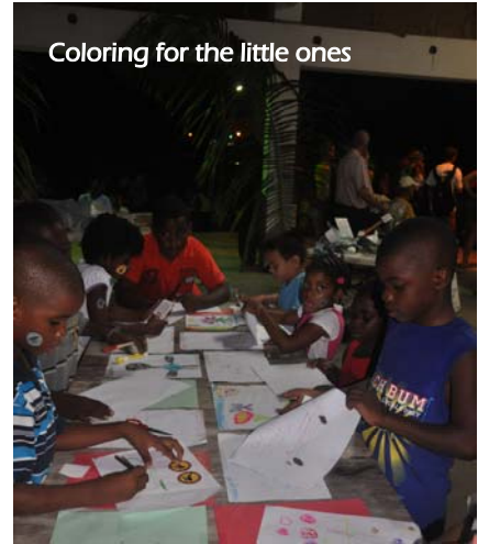
Coloring for the little ones