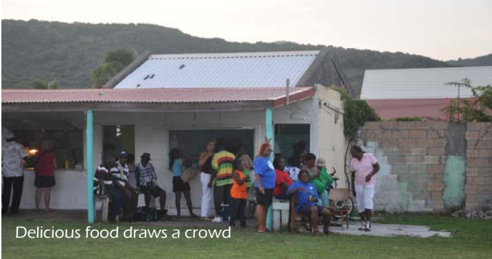
Delicious food draws a crowd