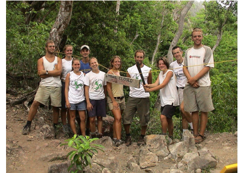
Group 2 from Working Abroad celebrate the completion of the crater trail, June 2003

There are lots of opportunities to assist, including helping clean mooring lines, coming on turtle patrol, watering and weeding at the botanical gardens, and more. Contact us if you are interested.