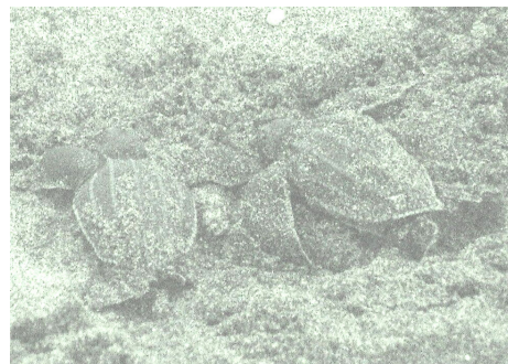
Leatherback hatchlings emerging from nest on Zeelandia Beach, July 2003

servations on Statia, and have recently finished a series of talks at the Terminal. Let us know if you would like us to give a talk at your club or group meeting. We are also organizing clean ups to try to make the beach a safer place for nesting turtles and also for hatchlings as they get easily trapped by objects such as plastic bags and wood debris. The next clean up is at 4pm on Saturday 13th September so please come along (parking near the Maison sur la Plage hotel buildings) to help out turtles on Statia.