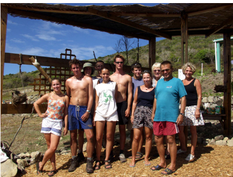
Celebration of completion of Touch Arbor by Morning Glory Foundation & 3rd Working Abroad volunteer group, August 2003.

The botanical garden is still in its infancy. Because of its large scale, the overall pro-